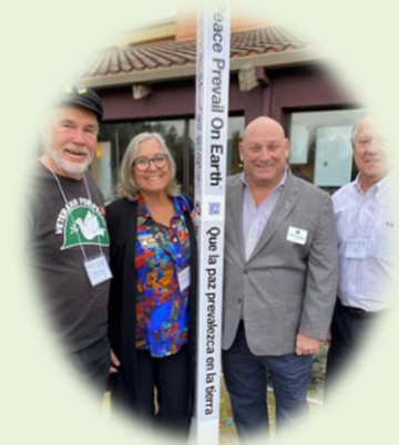
Peace Pole at DoubleTree Hotel